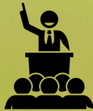
COMMUNITY OPINION LEADERS