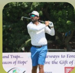
Murali Vijay Cricketer