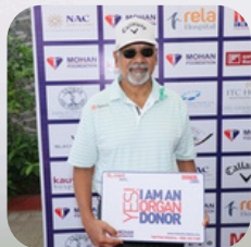
Mani Rathnam Director