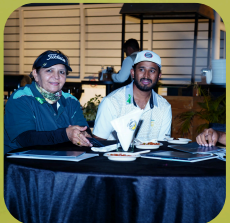
Golfer Enjoying the evening party